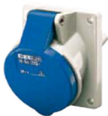
Angled 20° IP 44