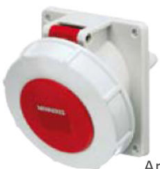
Angled 20° IP 67