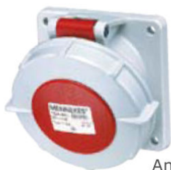
Angled 20° IP 67