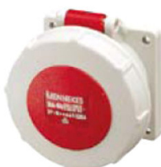
Straight IP 67