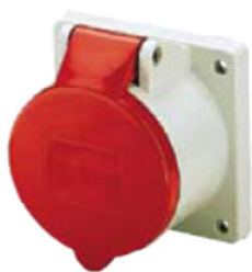
Straight IP 44